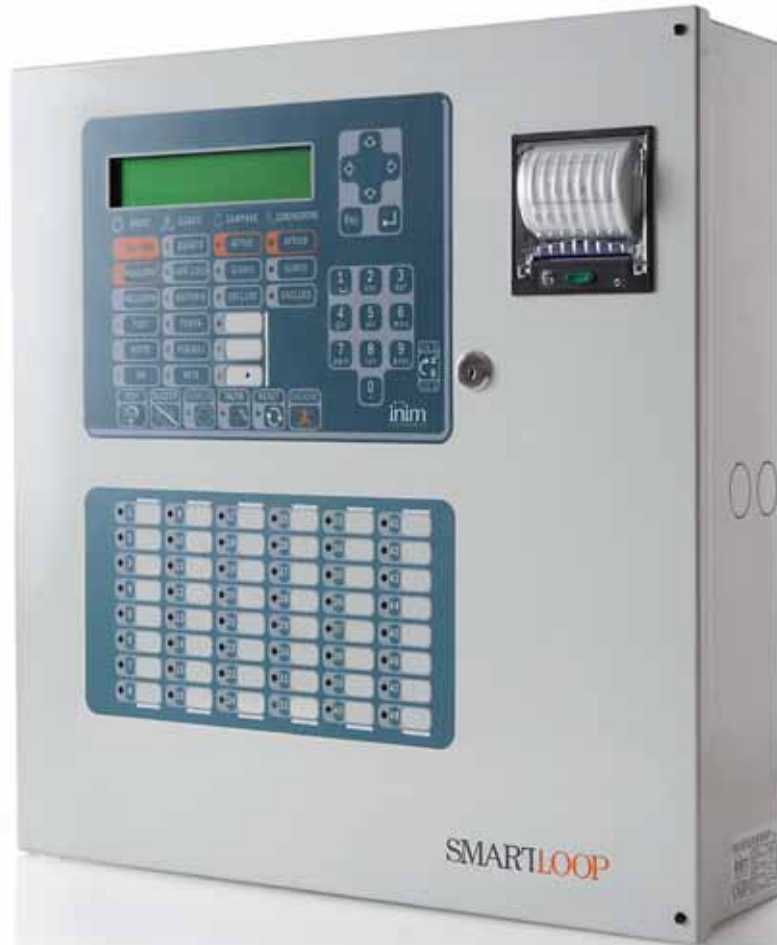
SmartLoop Analogue fire alarm control panel Programming from panel manual

0051 0051-CPR-0225 0051-CPR-0226 0051-CPR-0227 0051-CPR-0228 0051-CPR-0231 0051-CPR-0232