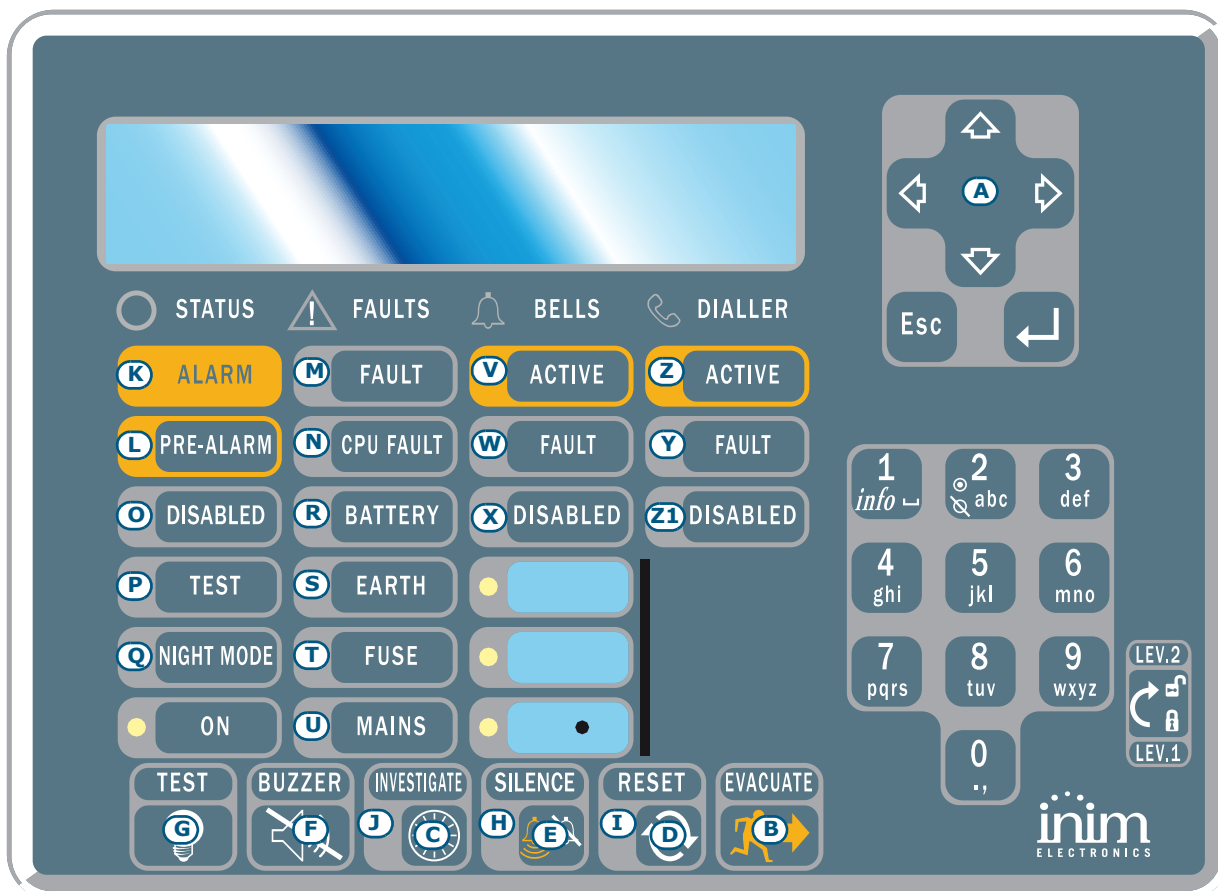
Figure 2 - Front view of the Repeater panel

This control panel supports up to four Repeater panels. Connected repeater panels replicate all the information provided by the control panel and allow access to all Level 1 and 2 functions (View active events, Reset, Silence, etc.), access to the main menu is not possible).