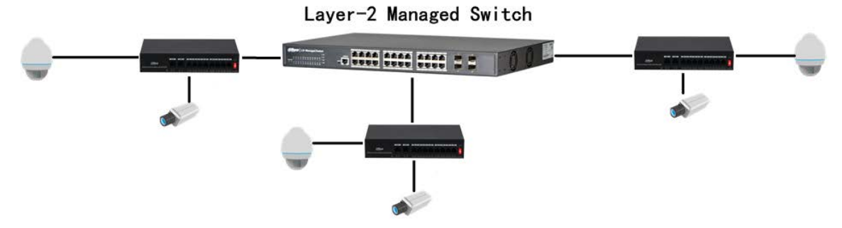
Figure 1-1 Typical networking scene