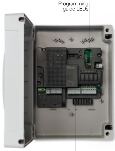
Removable terminals marked with connection codes

Microprocessor logic: the MC800 control unit combines the advantages of the Opera system with the advanced functions of the Nice systems (gradual start and deceleration, automatic memorising of both limit switch positions and pedestrian pass door function).