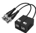
PFM800-E Passive HDCVI Balun