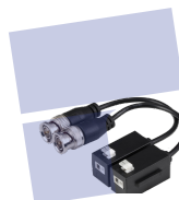
PFM800K-4K Passive Video Balun