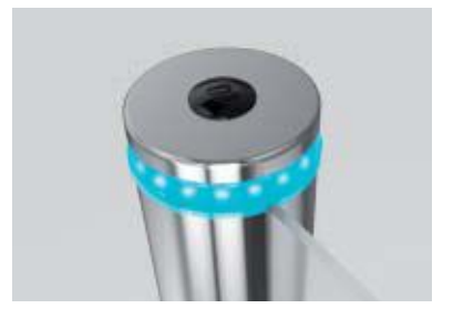
BLUE ILLUMINATED CROWN Warns that the leaf is about to close (Early warning flashing time can be adjusted electronically).