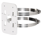
PFA152 Pole mount