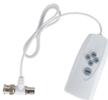
PFM820 UTC Controller