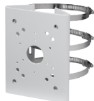
PFA150 Pole mount