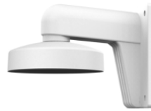
Wall mount DS-1272ZJ-110