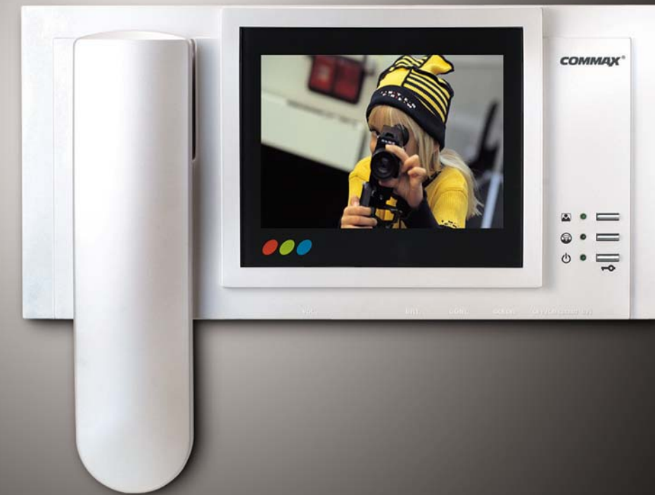
In-home unit CAV-51M Color