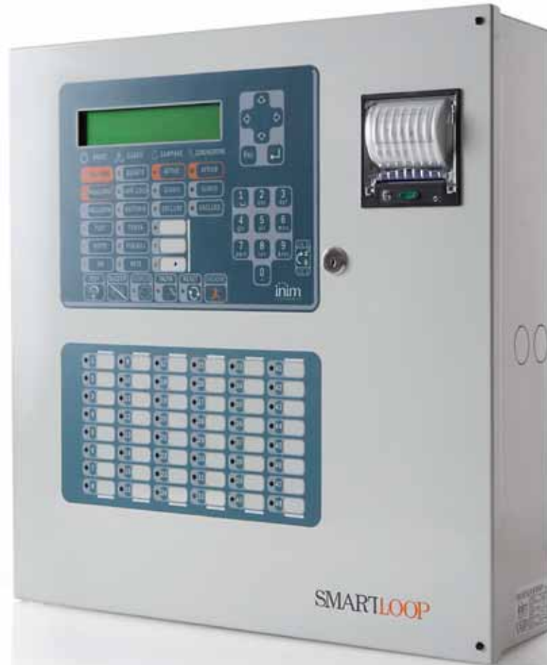
SmartLoop Analogue fire alarm control panel Programming from panel manual

0051 0051-CPR-0225 0051-CPR-0226 0051-CPR-0227 0051-CPR-0228 0051-CPR-0231 0051-CPR-0232